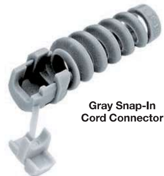
Gray Snap-In Cord Connector

Note: Catalog numbers above with "PK25" suffix, i.e. HJ1001GPK25, are bulk packed 25 per carton. See pages T-102 and T-103 for additional technical data and dimensional drawings.