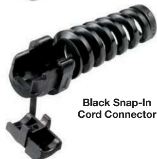
Black Snap-In Cord Connector