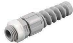
Gray Cord Connector with Spiral