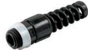
Black Cord Connector with Spiral

Note: * Locknuts sold separately. See page T-89.