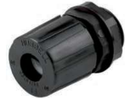
Black Cord Connector