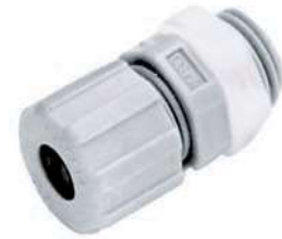
Gray Cord Connector